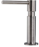
Dispenser Evo Satin